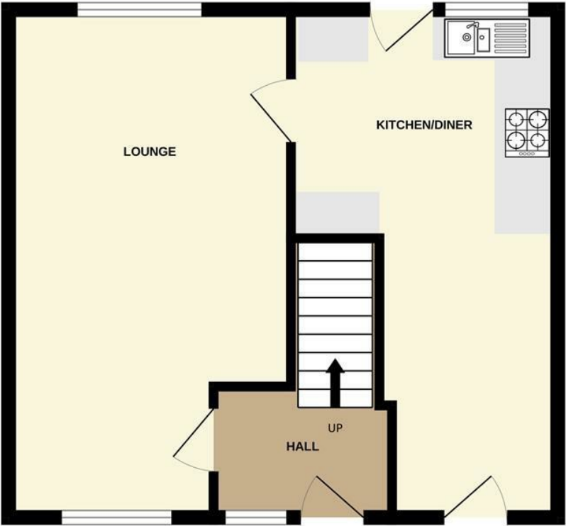
GROUND FLOOR 441 sq.ft. (41.0 sq.m.) approx.